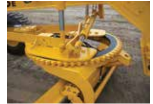
53" gear driven circle with "A" frame allows 360° blade rotation