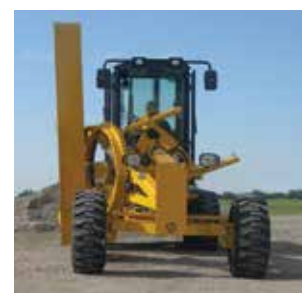
90° Bank slope saddle