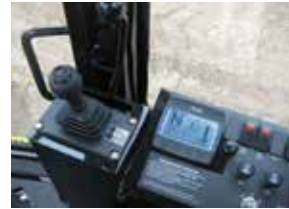
Full power shift transmission with torque converter